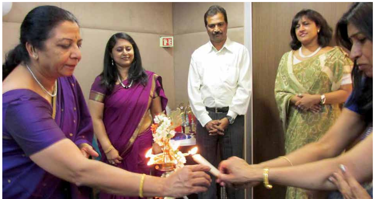
Celebration of Womanhood—eMERG India.

eMERG (Engineering manufacturer Entrepreneurs Resource Group), an association for Women in Technology, Business and Services organized a seminar on 14th March, 2014 to celebrate Woman's Day wherein eminent speakers spoke on topics that will help improve the quality of life for women. The theme 'Celebration of Womanhood' was specially chosen to mark the importance of Woman's Day, to acknowledge and