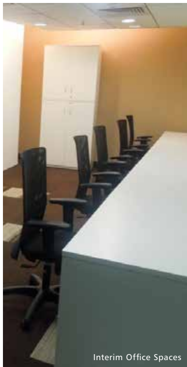
Interim Office Spaces