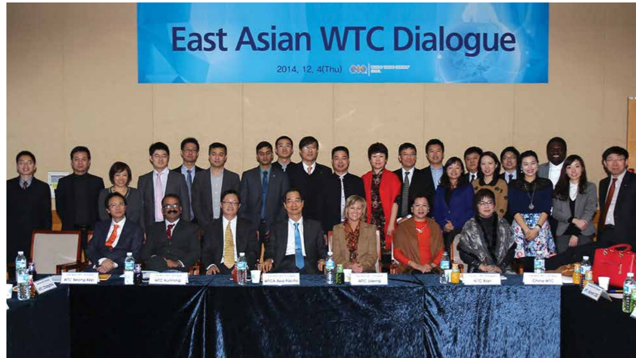
Delegates at the WTC East Asia Forum