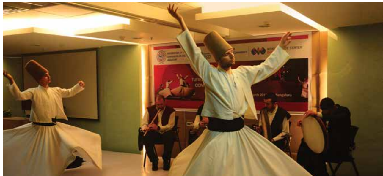
Sufi dance performance during the inaugural ceremony

Turkish Indian Chambers of Commerce and Industry (TICCI) in association with World Trade Center Bangalore and Federation of Karnataka Chambers of Commerce and Industry (FKCCI) organized an inaugural ceremony on 7th March, 2015 at the WTC Bangalore. The Turkish Indian Chamber of Commerce & Industry (TICCI) has opened an office in the city